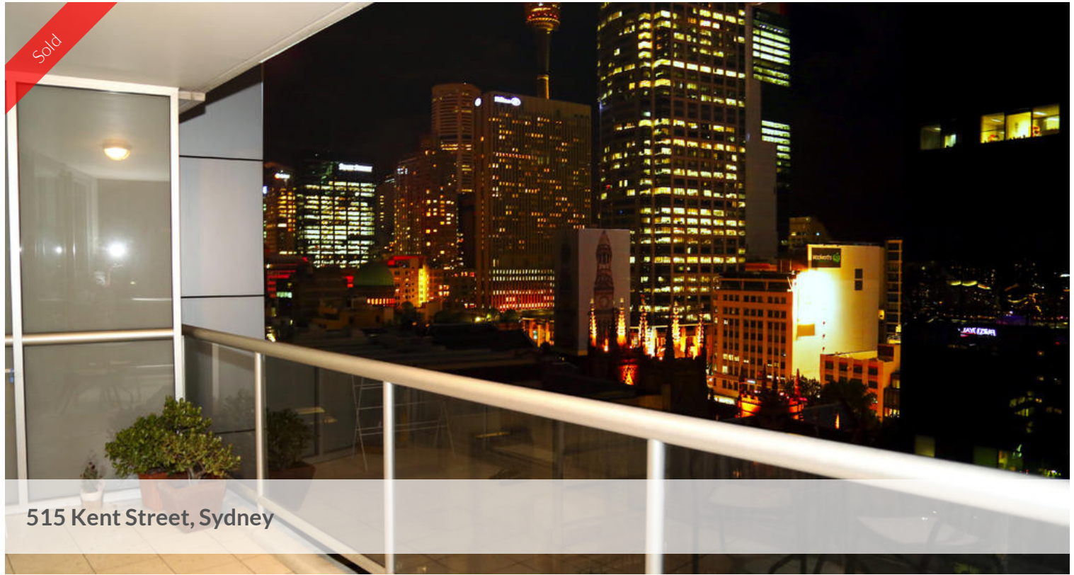
515 Kent Street, Sydney