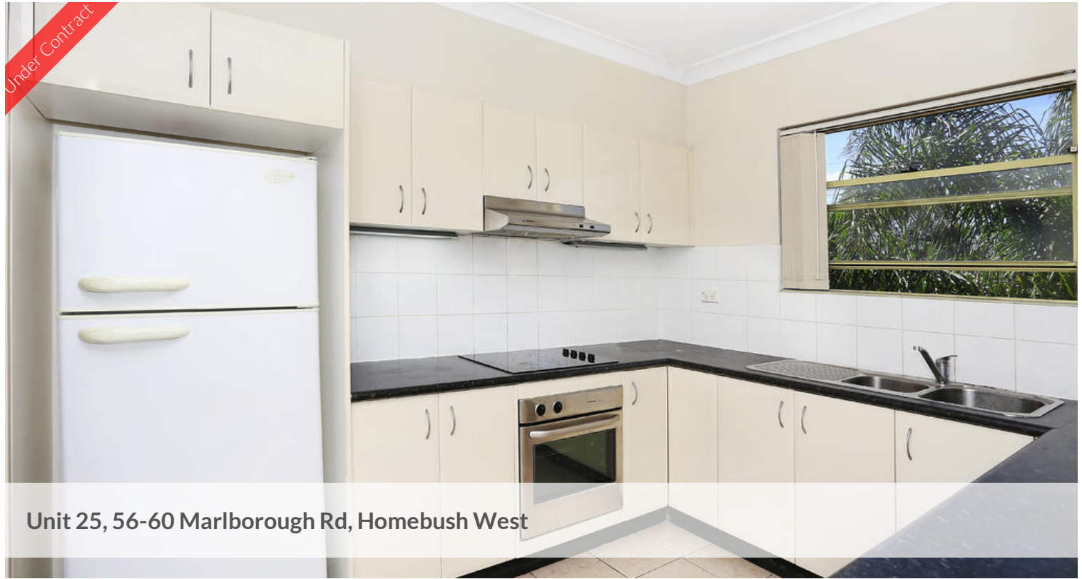
Unit 25, 56-60 Marlborough Rd, Homebush West